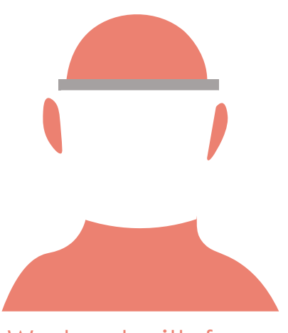
We treat with face protection.