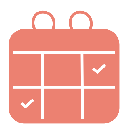
We plan all appointments with at least 15 minutes break to the next appointment.