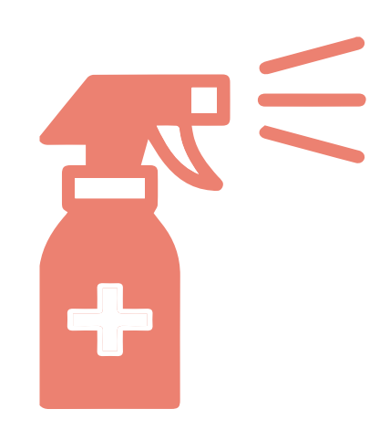
We disinfect regularly and sufficiently.