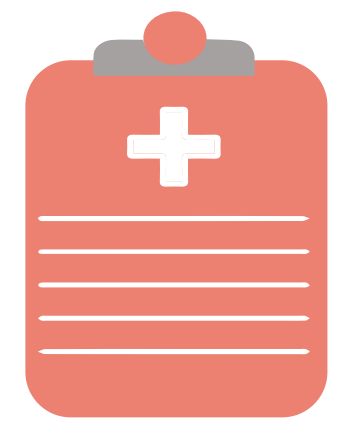
We carry out a health check before appointments are made.