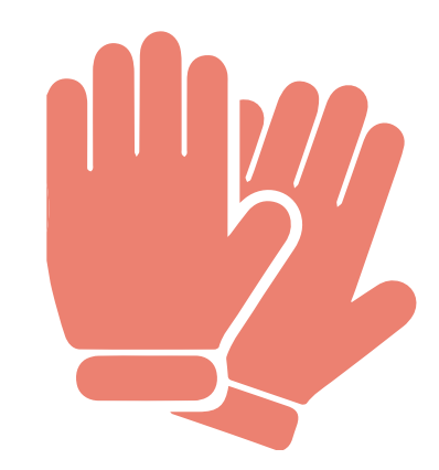
We use high-quality protective gloves.